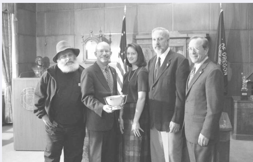
Governor Kulongoski meets with Rep. DeFazio and several scholarship recipients to discuss funding for higher education.

In the future, congressional pay raises should be no more than the Social Security COLA. Cuts to balance the budget should start at the top with congressional pay and not with the most vulnerable.